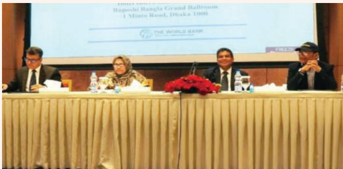
Training for IDA funded projects held at Hotel Inter-Continental

In addition, FAPAD and UNDP jointly organized a workshop on financial management on September 2022 at the Sarah Resort, Gazipur.