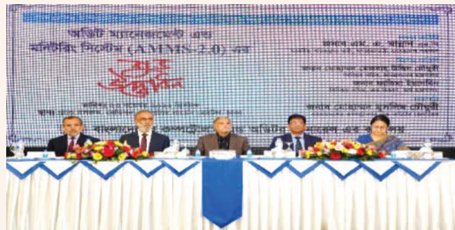
Inaugural ceremony of Audit Management and Monitoring System (AMMS 2.0)

Audit Management and Monitoring System (AMMS 2.0) has been developed to bring about digital transformation in audit process. This will help ensure good governance and improved public service delivery through quality audits. This web-based software, introduced by the Office of the Comptroller and Auditor General of Bangladesh, will pave the way for better audit management and interaction with the stakeholders by establishing more effective communication between the audit department and the auditee organizations. The system will thus save both cost and time.