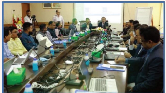
Workshop on Responsible Party Module of AMMS 2.0

The Responsible parties were Election Commission (EC), Bangladesh Public Service Commission (BPSC), Anti-Corruption Commission (ACC), Directorate of Registration, National Human Rights Commission (NHRC), Judicial Administration Training Institute.