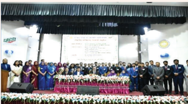
Valediction Ceremony for BCS Audit and Accounts Cadre (38 th Batch) at FIMA Auditorium.

After having completed a year-long departmental training in FIMA, Assistant Accountant Generals (AAGs) belonging to 38 th batch (Audit and Accounts) Cadre have been posted in different offices under the Audit and Accounts department. On the occasion of completion of their training, a valediction ceremony was held in the FIMA auditorium on July 30, 2022.