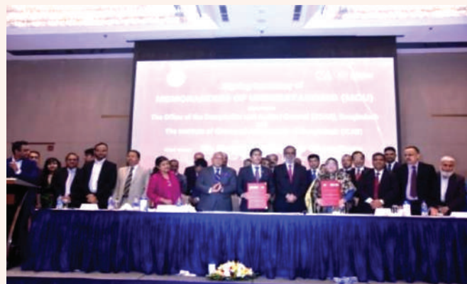
Signing Ceremony of Memorandum of Understanding (MoU)