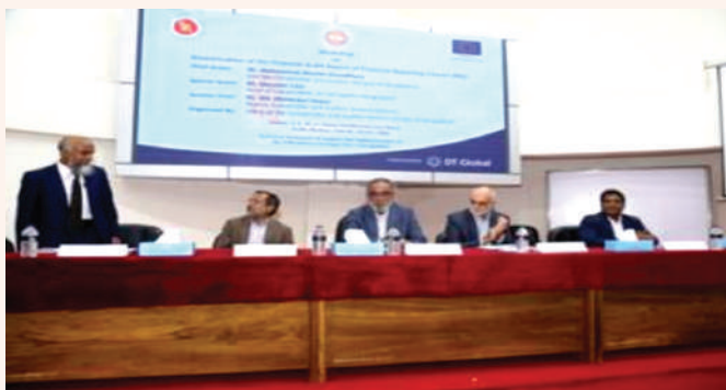
Workshop on “Dissemination of the Financial Audit Report of Financial Reporting Council (FRC)”