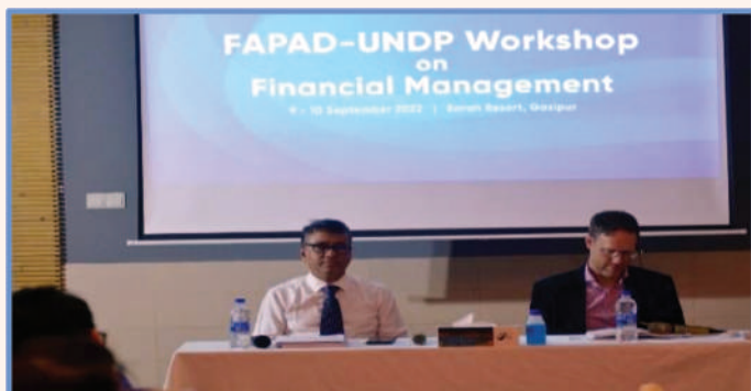
FAPAD-UNDP workshop on Financial Management at Sarah Resort, Gazipur

In addition, FAPAD and UNDP jointly organized a workshop on financial management on September 2022 at the Sarah Resort, Gazipur.