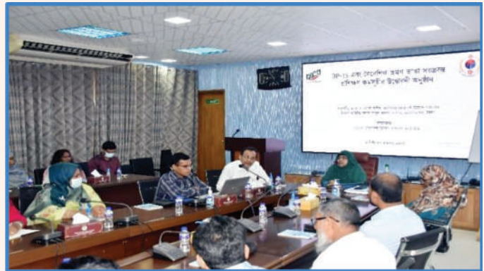
Day long training on DP-35 and Foreign TA/DA

In consultation with the office of the Comptroller and Auditor General of Bangladesh and under the joint initiative of the Controller General Defence Finance and Financial Management Academy (FIMA), day-long training courses of 05 batches on DP-35 and Foreign TA/DA were held on November 2022 at CGDF office conference room. About 150 DAFCs, Superintendents and Auditors were trained on DP-35 and Foreign TA/DA.