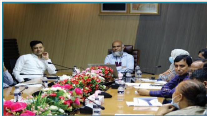
In-house training on cash incentive audit

on various foreign exchange (FE) circular of Bangladesh Bank that would help them conduct an audit on cash subsidy given by the government for exporting of goods and services.