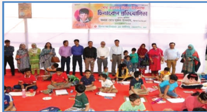
Respected CGA along with other officials observes childrens' painting competition on Sheikh Russel Day

Sheikh Russel Day 2022 was celebrated at the office of the Controller General of Accounts (CGA) with pomp and dignity marking 59th birthday of Shaheed Russel. On the occasion of the day, floral wreaths were laid on the portrait of Sheikh Russel as part of the program. Latter voluntary blood donation program, painting exhibition on Sheikh Russel, painting competition, documentary screening, discussions and prayers were held on the occasion of the day.