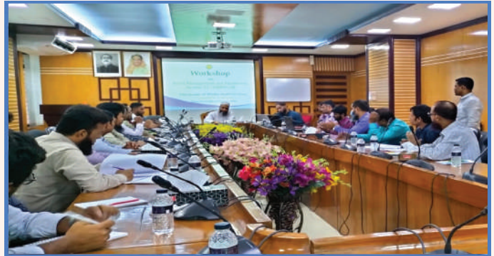
Workshop on Responsible Party Module of AMMS 2.0

Directorate of Works Audit organizes in-house training for developing the capacity of its human resources. From July to December 2022, several trainings/workshops were arranged on Individual Audit Planning, Model Para writing, Documentation, Conducting the Audit, Data Analysis, Quality Control System, Code of Ethics, PPA & PPR and Budget & Accounting Classification System etc.