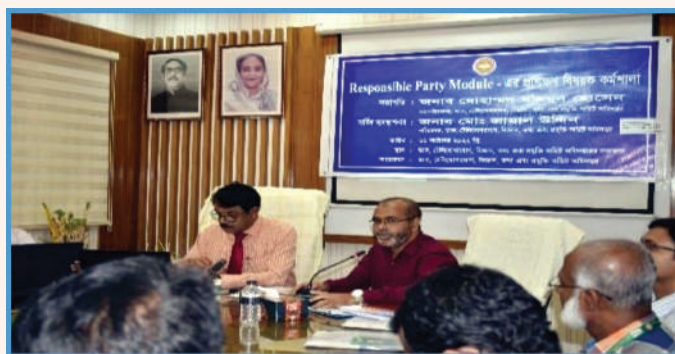
Workshop on RP module of AMMS 2.0

Posts, Telecommunication, Science, Information and Technology (PTST) Audit Directorate arranged a workshop on AMMS 2.0 software for Responsible Parties (RP) in order to disseminate information on RP module at PTST conference.