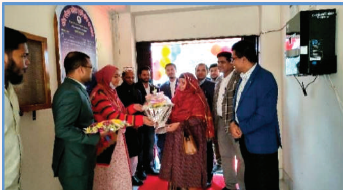
CGDF during her visit to Office of Area FC (Army), Ghatail