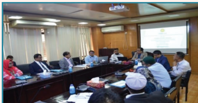
Workshop on AMMS 2.0 for the Responsible Party held at Commercial Audit Directorate on December 14, 2022

In addition, Commercial Audit Directorate conducted another workshop on AMMS 2.0 for the audited entity (Responsible Party) at the conference room. 38 participants from the Ministry of Commerce and Ministry of Textiles & Jute attended this workshop.