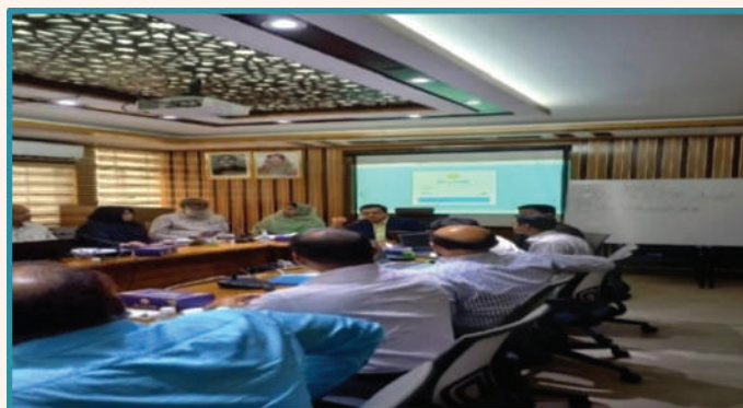
A day-long workshop for the responsible parties on AMMS 2.0

On November 29, 2022 a day-long workshop was organized for the responsible parties on AMMS 2.0, in which core members from different ministries participated. The workshop provided an idea of the significance of this software and demonstrated the way to operate it as well.