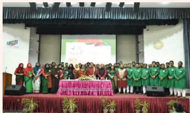
National Victory Day observed at FIMA Auditorium