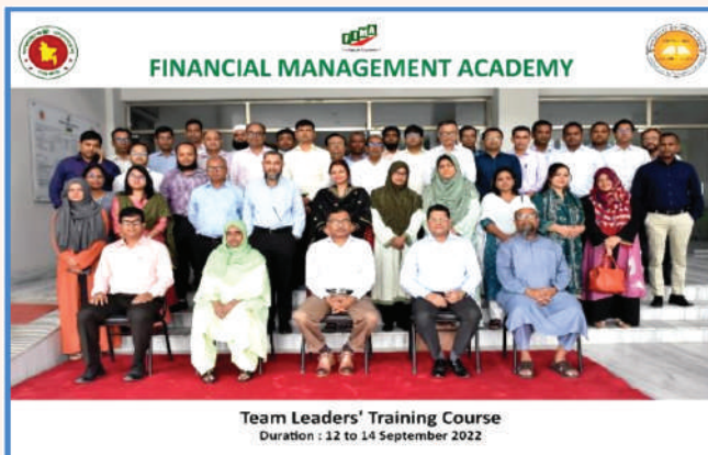
Photo gallery of training held at FIMA

FIMA conducted 40 training courses/workshops of different durations throughout July to December 2022. Of them, 28 were for officials/staff of the audit and accounts department working in different positions from 5 th to 11 th grade in which 1223 persons participated. The rest 12 courses were request course conducted for the officers belonging to other than audit and accounts department where the number of participants were 296.