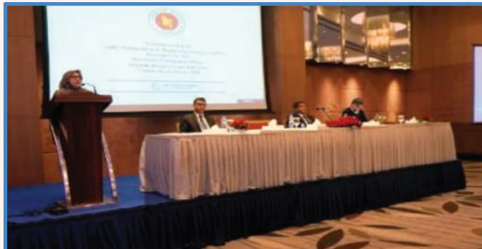
DCAG (Senior) delivers her speech at RP Module Training for IDA funded projects held at Hotel Inter-Continental, Dhaka

Several workshops were arranged with a view to achieving better knowledge in Public Financial Management. In line with this, FAPAD coordinated and conducted RP module training of AMMS 2.0 for IDA funded projects at Hotel Inter-Continental on December 14, 2022.