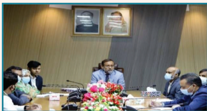
In-house training on GASB, Code of Ethics (COE) and Quality Control System (QCS) held at the conference room.

Civil Audit Directorate is very conscious and sincere about improving the efficiency and competency of its employees. The Directorate often arranges in-house training which are proved to be fruitful for building the capacity of its human resources. Last year from July 3 to July 7 and July 24 to July 27, the Directorate organized a nine day-long in-house training on Government Auditing Standards of Bangladesh (GASB), Code of Ethics (COE) and Quality Control System (QCS) at the conference room.