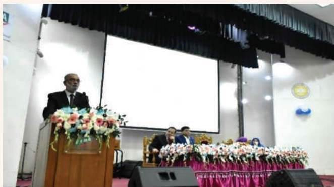
Inauguration Ceremony of Departmental Training for BCS Audit and Accounts Cadre (40 th Batch) at FIMA auditorium