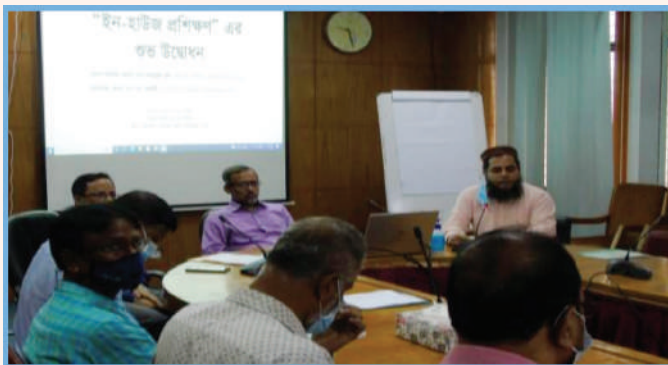
Inauguration of In-House training

Transport Audit Directorate is one of the largest Audit Directorates under the Office of the Comptroller and Auditor General of Bangladesh. Several in-house trainings and workshops on code of Ethics, Model para writing, AMMS and PPR were conducted throughout the year.