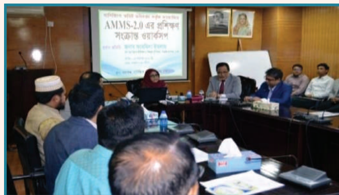
Workshop on AMMS 2.0 for the Responsible Party held at Commercial Audit Directorate on December 13, 2022

Commercial Audit Directorate conducted a workshop on AMMS 2.0 for the Audited Entity (Responsible Party) at the conference room. DCAG (Senior) presided over the workshop.