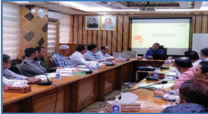
In-house training on Service procurement

An in-house training on 'Purchase of intellectual and professional services (Service procurement)' was arranged on August 10, 2022