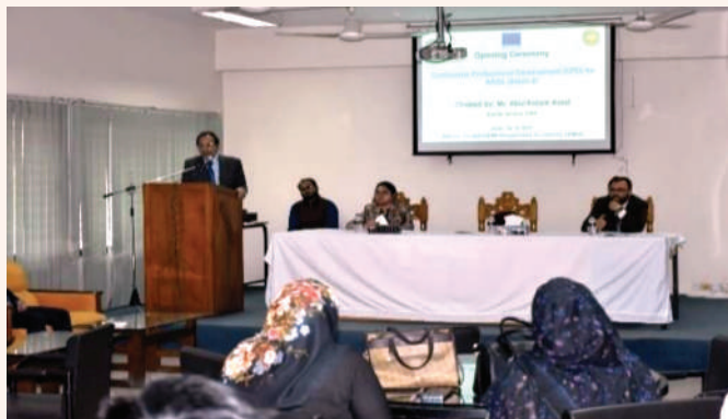
Opening Ceremony of Continuous Professional Development

With the aim of keeping the officials working at different level of Audit and Accounts Department informed about the ever-changing frontier of relevant knowledge and idea, the office of the Comptroller and Auditor General (OCAG) of Bangladesh has taken initiative to provide training on a continuous basis.