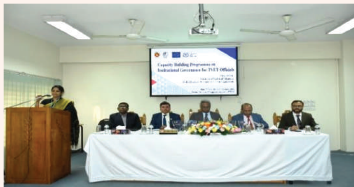
Capacity Building Programme on Institutional Governance for TVET Officials

Apart from its regular and special training, workshop, seminar for the personnel of the audit & accounts department; FIMA regularly conducts request courses for other entities/departments. Two sets of such request courses have been completed recently. One is for financial management personnel of 'Skills for Employment Investment Program' (SEIP) and the other is for officials from Technical Education Board, Polytechnic Institute, Technical School and College etc under the Directorate of Technical Education and 'Skills 21 – Empowering Citizens for Inclusive and Sustainable Growth Project' under Madrasa and Technical Education Division. As per agreement between FIMA and the SEIP, FIMA arranged training for 12 batches of their officials and the total number of personnel who received training is 289. Also, following an agreement between FIMA and Technical Teachers Training College, FIMA conducted training for their concerned persons in 6 batches. The number of recipients of this training is 151.