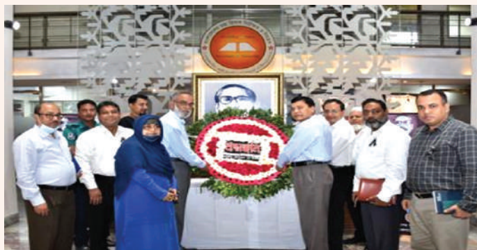
On the occasion of National Mourning Day, a floral wreath is placed at the portrait of the father of the nation at Audit Bhavan

In order to observe the 47 th martyrdom anniversary of the great leader of our Liberation War, the father of the Nation, Bangabandhu Sheikh Mujibur Rahman and National Mourning Day, discussions and prayer mahfil were organized by the office of the Comptroller and Auditor General of Bangladesh at 11:30 am in F. K. M. A. Baqui Auditorium on August 21, 2022. Officials of audit and accounts department were present on the occasion.