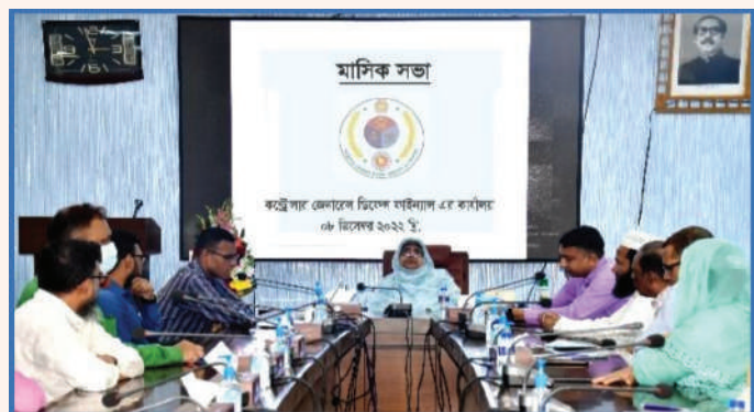
A meeting on Action Plan Implementation of CGDF Office and its subordinate offices is held on December 08, 2022.