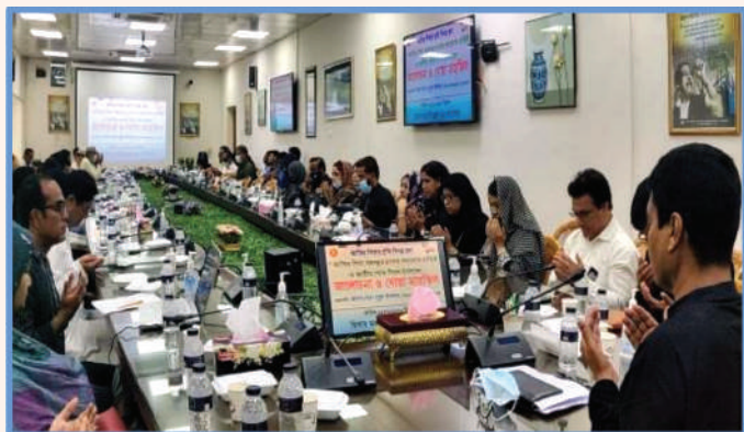
Officials of OCGA offering prayer at the end of the discussion meeting and doa mahfil on national mourning day.

A documentary based on the work and biography of the Father of the Nation Bangabandhu Sheikh Mujibur Rahman was screened in the program paying respects to Bangabandhu. A blood donation program was also organized at the premises of the office of CGA.