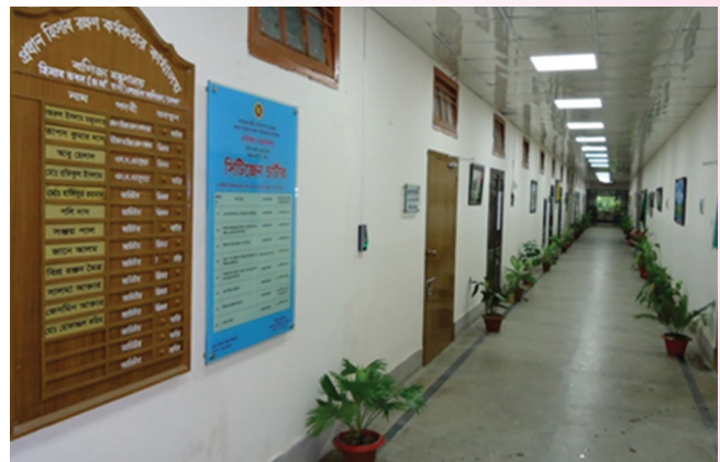
CAO, Ministry of Commerce at Hisab Bhaban

Office of the Chief Accounts Officer, Local Government Division & Office of the Chief Accounts Officer, Ministry of Commerce have been relocated to Hisab Bhaban at Segunbagicha. Earlier the two Chief Accounts Offices had been operating their functions in a rented house at Mouchak in Dhaka for a long time. Because of shifting two Chief Accounts Offices to CGA main building, a good amount of government money will be saved per year.