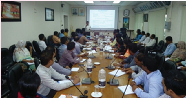
Ongoing Training Program of newly recruited Auditors and Junior Auditors at CGA Conference Room

years. Having a short course of foundation training on financial rules and regulations, the selected candidates have been posted at different offices under CGA command. The office of CGA has planned to fill up the remaining vacant posts with fair, transparent and competitive recruitment process within the shortest possible time.