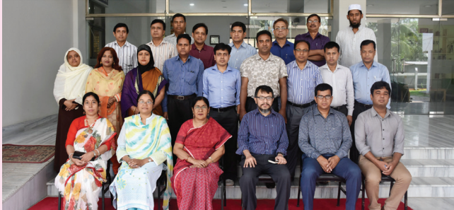
Participants of PPR-2008 Course with Director General, FIMA

FIMA organized two Training Courses on PPA-2006 & PPR-2008 from 28th January to 1st February, 2018 and 15-19 April, 2018 respectively which were participated by a total of 45 officers from Audit and Accounts Department.