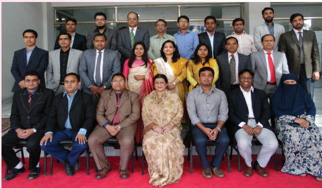
Participants of 28th TIBAS with Director General, FIMA

Courses, took place from 04th February – 15th February, 2018 and 6th May – 17th May, 2018 respectively. Fifty six participants from different ministries and departments participated in the course. Apart from the basics of budgeting, government accounting and auditing, participants of this high-profile training course also gained a first-hand exposure to monetary and fiscal policies, public debt and cash management as well as mobilization of foreign aid and its underlying accountability mechanisms.