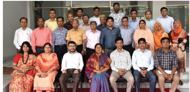
Participants of Management and Leadership Training with Director General, FIMA

FIMA under the direct guidelines from Comptroller and Auditor General Office organized for the first time a five day long training named 'Management and Leadership Training program' to enhance the professional efficiency and leadership skills of auditors. This training was held from 01-05 April, 2018 where 23 participants from various offices and ranks took part.