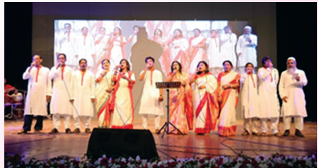
Cultural evening at National Museum Auditorium, Shahbagh