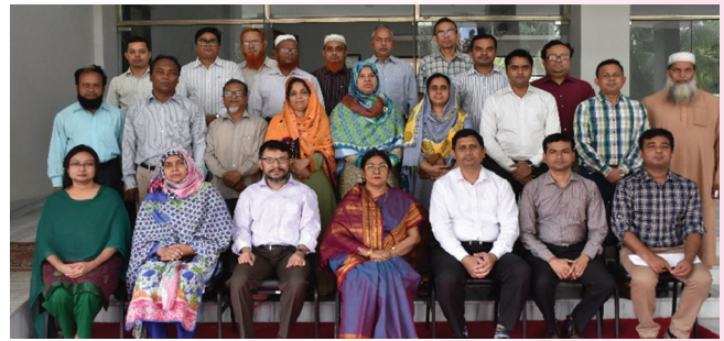
Participants of Public Debt Management Audit Training with Director General, FIMA

A one-week Public Debt Management Audit Training, first of its kind, was organized at FIMA for the officials of Audit and Accounts Department from 01 April to 05 April 2018. Twenty two officers from various offices of the department participated in the training program organized.