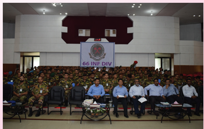
Representatives from Audit Department with the participants