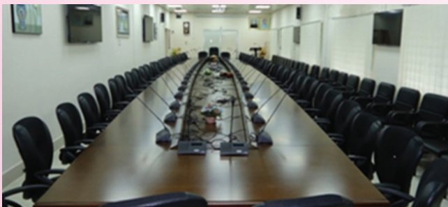
Newly Constructed CGA Conference Room

A newly constructed conference room went in operation at the office of the Controller General of Accounts. The conference room was inaugurated by the Hon'ble Comptroller and Auditor General Mr. Masud Ahmed on 16 April, 2018. Along with other office space of CAO, Postal Department at Hisab Bhaban, the 3rd floor of that office was also occupied by thousands of old sacks of disposable records for decades. Even the piles of old sacks went up to the ceiling of the corridors and the rooms. As a result thousands square feet of valuable office space remained unused. The reality is that the new conference room has emerged from the piles of the old sacks. The Conference Room with the sitting arrangement of 80 people has been facilitated with modern technological support and amenities like latest sound system with auto camera, display devices etc. A buffet room and two wash rooms for male & female with modern facilities have also been constructed adjacent to the newly constructed CGA Conference Room.