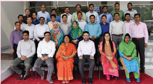
Participants of IT Audit Course (Batch-5) with Director General, FIMA

FIMA organized two IT Audit Training Courses from 11-15 February, 2018 (Batch-05) and 08-12 April, 2018 (Batch-06) respectively. These two training courses were participated by a total of 47 officers from Audit and Accounts Department.