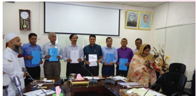
Controller General of Accounts (CGA) and Divisional Controller of Accounts (DCA) with the Signed APA

Following this initiative, APA was also signed among CGA and 7 DCAs also.