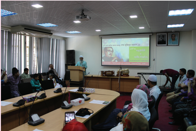
In-house discussion at CGDF office on the National Children's Day

the 99th Birth Anniversary of Father of the Nation Bangabandhu Sheikh Mujibur Rahman and National Children's Day 2018.