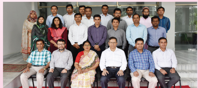
Participants of Mission Audit Training Course with DG FIMA

FIMA organized three Mission Audit Training Course under the name of Mission Audit training Course: Bank Branches/Exchange Houses Abroad of State Owned Bank; Mission Audit Training Course: Biman Bangladesh Airlines and Mission Audit Training Course: Mission and Embassy for OCAG officials from 11-15 March, 2018 and 8-15 April, 2018 respectively. The first training was participated by 19 officers and the second one by 15 officers from Audit and Accounts Department nominated by OCAG.