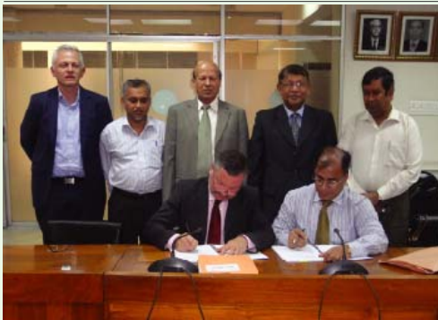
Signing of Management and Implementation Support Consultant (MISC) contract for SPEMP-B at OCG Conference room on May 28, 2012

A signing ceremony of Management and Implementation Support Consultant (MISC) contract was held on May 28, 2012 for SPEMP Project B: Strengthening the Office of the Comptroller and Auditor General) with PKF (UK) LLP. The ceremony was held in the presence of the Comptroller and Auditor General and World Bank representatives at the OCG conference room.