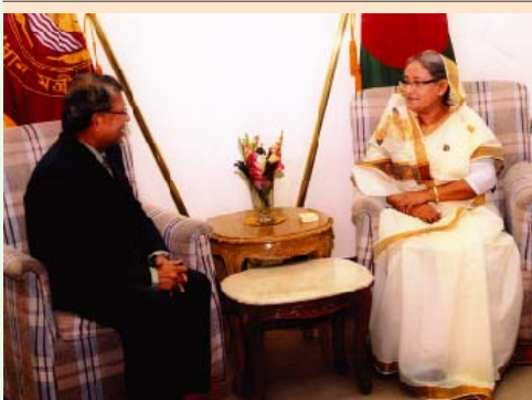
CAG calls on Hon'ble Prime Minister Sheikh Hasina at Prime Minister's Office on May 10, 2012.

Ahead of observing Audit Day, the Comptroller and Auditor General (CAG) of Bangladesh Ahmed Ataul Hakeem called on the Prime Minister Sheikh Hasina at the Prime Minister's Office on May 10, 2012.