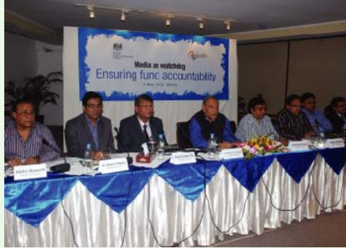
Roundtable discussion on 'Media as Watchdog: Ensuring fund accountability' held at the BRAC Centre Inn on May 5, 2012