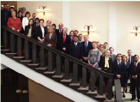
Participants at the INTOSAI Sub-committee on Internal Control Standards held in Warsaw, Poland during April 24-25, 2012

Introduction to the discussion on reporting on internal control was delivered by NIK. The SAI of Lithuania and South Africa shared their experiences in the field of reporting on internal control. Representative of the SAI of the Netherlands also presented an update on the e-platform project.