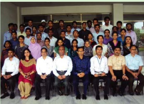
Director General, FIMA with the 30 th BCS (Audit and Accounts) Cadre Probationers at the Financial Management Academy (FIMA)

38 officers of BCS : Audit and Accounts Cadre (30th batch) joined the OCG as Assistant Accountants General on June 10, 2012. Subsequently, these officers joined the Financial Management Academy (FIMA) on June 11, 2012 for their departmental training.