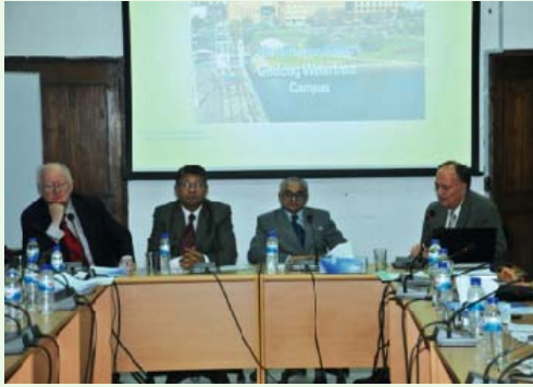
Workshop on Financial Oversight : The Role of Parliamentary Committees and the Comptroller and Auditor General held during 21-22 May, 2012

The workshop was designed to provide a Bangladesh-specific version of the annual PAC summer residency programme that WBI organizes in Australia. Delegates from the PAC and Parliament Secretariat have attended this residency program over the past six years. To that end, at the suggestion of the Honorable Chairman of the PAC and the Comptroller and Auditor-General, WBI-CIDA assembled a high-level resource team to expose a larger number of Members of Parliament, staff from the Parliament Secretariat and the Office of the Comptroller and Auditor-General to the good practices of democratic systems and discuss the issues that need to be addressed in a way that suits the Bangladesh's legal and operational framework.