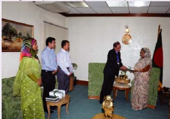
CAG apprising the Honourable Prime Minister of audit reports on April 15, 2014

The Honourable Prime Minister Sheikh Hasina stressed the need to adopt advanced auditing approaches and techniques to ensure transparency and accountability in public financial management. She said this when the CAG apprised her of 17 audit reports at her office on April 15, 2014. The CAG referred to the initiatives that have been taken at OCAG which are expected to bring about qualitative changes in the audit process.