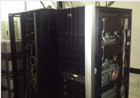
OCAG Data Centre

Audit Monitoring & Management System (AMMS) is a home-grown, customized piece of software developed by the Strengthening Comptrollership & Oversight of Public Expenditure (SCOPE) Project and implemented in OCAG through its Data Centre which is connected using fibre optic back-bone with four distinct office buildings, funded by Department of Foreign Affairs, Trade and Development, Government of Canada. It is a step towards establishing a paperless office environment in the audit department under the CAG. According to the audit processes and nature of work, AMMS is divided into four modules so that it can be easily incorporated by the user and by the top management.