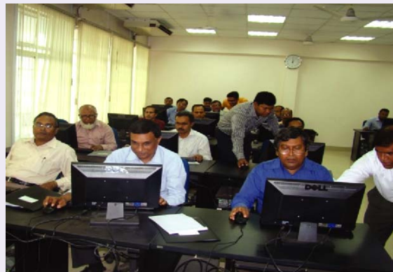
AMMS training session in SCOPE computer lab

The second module (Field Audit) is used by 8 of the 10 audit directorates, and according to the preceding chart, on an average 75% of all field audit team members from eight audit directorates are now using this module. The number is gradually increasing in each quarter, as training has been provided continuously to all audit directorates by SCOPE technical persons in SCOPE computer lab. This has largely facilitated performing audits using a structured methodology and audit working paper templates. AMMS helps to adopt the risk-based audit approach advocated by INTOSAI in relation to ISSAI standards.