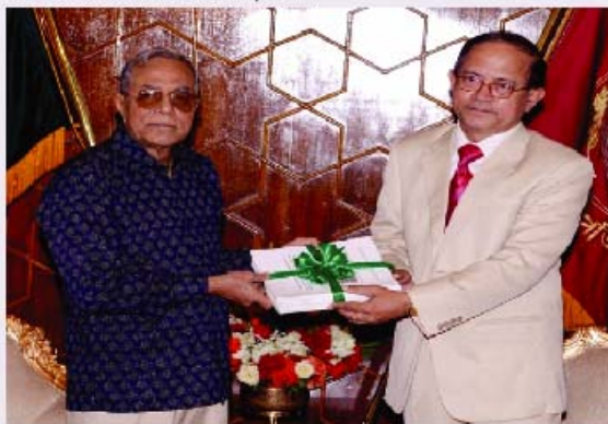
CAG handing over audit reports to the Honourable President on June 08, 2014