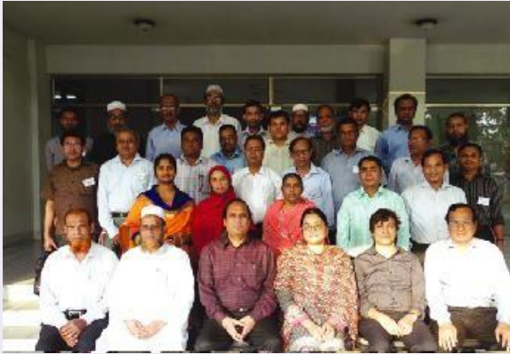
Participants of PPR course (PPC 1) along with Director General Financial Management Academy (FIMA)