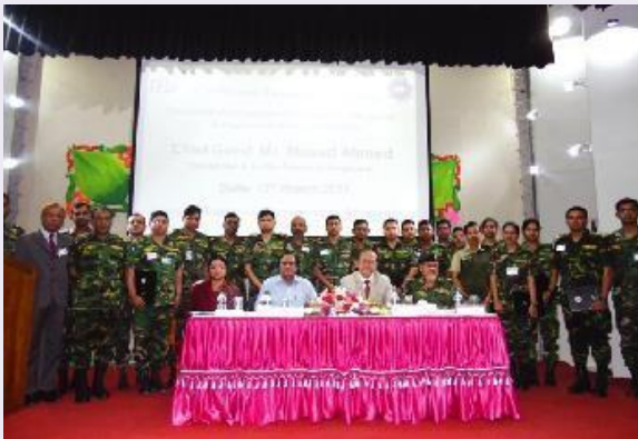
Participants of Bangladesh Army along with honorable C&AG

A two-week Financial Management Course was organized at FIMA for officers of Bangladesh Army from 1st March to 12th March 2015. Twenty-four mid-level Army officers in the rank of Major participated in the training program.