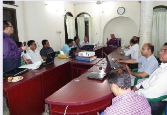
Inspection by DG Commercial