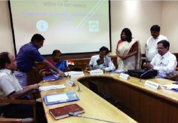
DCAG (Senior) signed the twinning arrangement OCAG Bangladesh and CAG of India