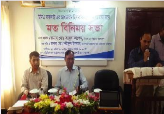
CGA exchanges views with the District Accounts Officers under DCA Rajshahi