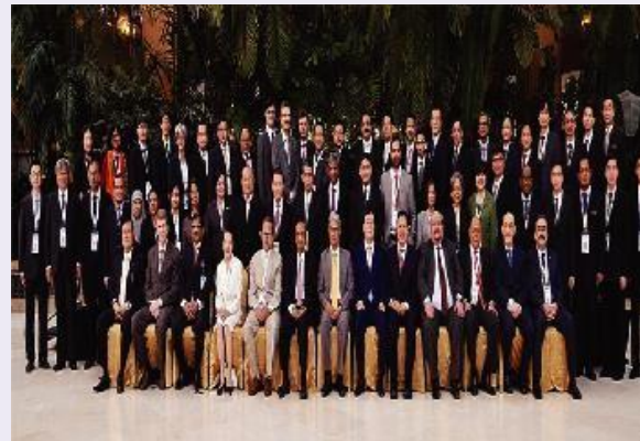
Honorable C&AG and the delegates of 13th ASOSAI Assembly and 6th ASOSAI Symposium in Kuala Lumpur, Malaysia

In the 13th ASOSAI Assembly, a total number of 191 participants from 39 ASOSAI members as well as observers including INTOSAI, IDI, EUROSAL, and AFROSAL were participated. At the Assembly, newly drafted ASOSAI Strategic Plan 2016-2021 was approved. Accordingly, capacity development activities are to be strengthened by introducing a two-year pilot program with a blended approach combining e-learning and face-to-face workshop. In addition, the roles and responsibilities have also been expanded with the changes of the existing Training Committee and Training Administrator into Capacity Development Committee and Capacity Development Administrator. The ASOSAI financial statements and the recommendations of the Audit Committee on external audit report for FYs 2012-2014 were adopted, while the three-year budget plan for FYs 2016-2018 was approved. Also, the Financial Rules and the Auditing Policies for ASOSAI was approved which will be effective from 01 January, 2016.