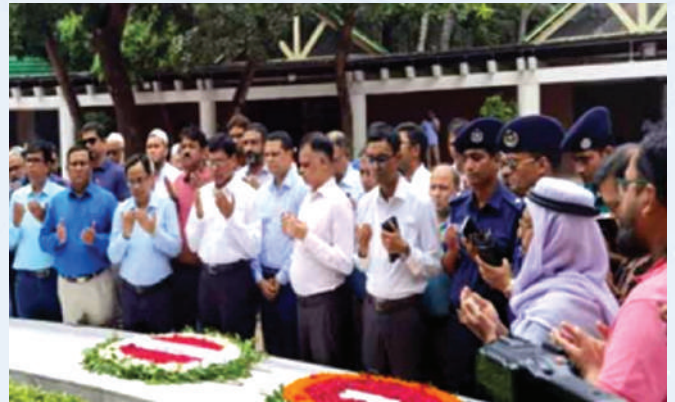
Honourable CAG places wreath at the mausoleum of the father of the nation Bangabandhu Sheikh Mujibur Rahman

Honourable CAG paid high tributes to the Father of the nation Bangabandhu Sheikh Mujibur Rahman by placing a wreath at his mausoleum on July 28, 2023. After placing the wreath honorable CAG along with CAG officials stood in solemn silence for some time as a mark of profound respect to the memory of the architect of independence, who was brutally killed on 15 August 1975 along with most of his family members. Prayers were also offered seeking continued peace, progress and prosperity of the nation.