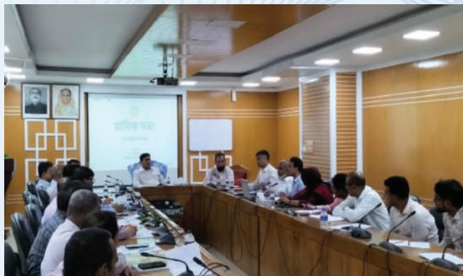
Director General delivers his instructions to Officials at Monthly Meeting.

Besides, a Special Monthly Meeting was held at the Conference Room to accelerate overall activities of this office. The then Director General presided over the meeting.