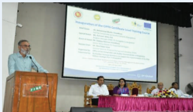
CIPFA certificate level training course being launched at FIMA

FIMA facilitates conducting CIPFA and CISA professional courses sponsored by EU supported TA project. These two are internationally acclaimed and recognised professional courses suitable for acquiring professional competence in the sector of public auditing and accounting.