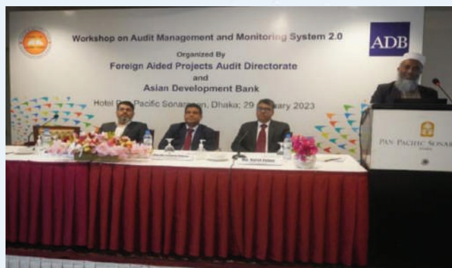
A workshop on Audit Management and Monitoring System 2.0 jointly organized by ADB and FAPAD

Several workshops were arranged by FAPAD on AMMS 2.0 for the Responsible party during the said period. A workshop on Audit Management and Monitoring System (AMMS-2.0) was held on 29 January 2023 at Hotel Pan Pacific Sonargaon, Dhaka organized by the FAPAD and Asian Development Bank (ADB) jointly.