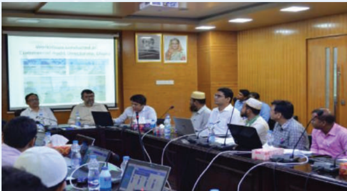
Workshop on settlement and sending replies to Audit observations using AMMS 2.0 on June 1, 2023