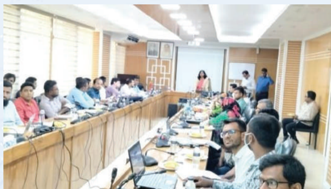
In-house training on D-Nothi

Works Audit Directorate organizes In-House Training to increase the capacity of its human resources on a regular basis. From January to June 2023, training session on D-Nothi was held at the Conference Room of the Directorate. Trainers from A2i program, ICT division conducted the sessions.