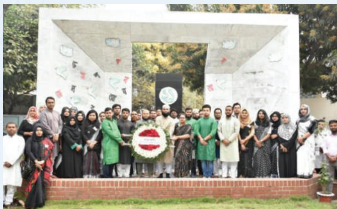
On the occasion of International Mother Language Day, a floral wreath is placed at the Shaheed Minar, FIMA

The International Mother Language Day was observed with due solemnity on 21 st February 2023 at FIMA campus. The observance was marked by placing floral wreath at the altar of the Shaheed Minar at FIMA premises erected in memory of the language martyrs.