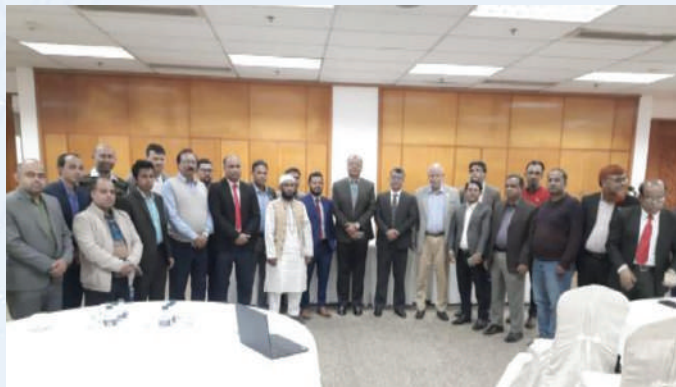
Entry Meeting held with UNDP at Bangladesh-China Convention Centre

Entry Meeting: FAPAD organized a couple of entry meetings held on 15 January 2023 and 10 March 2023. Concerned project directors, representatives from the concerned development partners and financial analysts participated in those entry meetings.