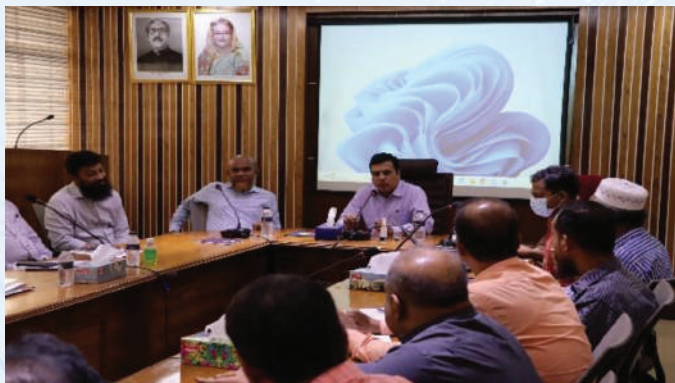
A day-long workshop on Financial Audit

To conduct financial audit effectively and to train up its human resources, a day-long workshop on financial audit was held on 16 May, 2023. The workshop was chaired by respected Director General of this directorate.