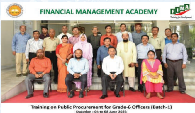
Training on Public Procurement for Grade-6 Officers (Batch-1) Duration : 04 to 08 June 2023

The main focus of the training was on different important aspects of public procurement namely preparation of tender documents (works, goods and services), tender submission, evaluation, award of contract, contract management including handling of complaints and appeals and use of e-GP.