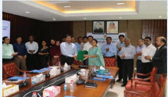
APA signing between the Controller General of Accounts (CGA) & the Senior Secretary of Finance Division

Annual Performance Agreement (2023-24) was signed between the Controller General of Accounts (CGA) & the Senior Secretary of Finance Division on 19 th June 2023. The Vision, Mission, Strategic Objectives and Functions of the office of the Controller General of Accounts were reflected in the Annual Performance Agreement (2023-24).