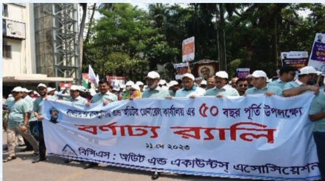
A spectacular rally to celebrate golden jubilee of OCAG