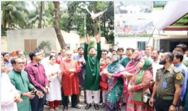
CGA Md. Nurul Islam flies pigeons marking the Independence and National Day

Independence and National Day was celebrated in a dignified and solemn atmosphere on 26 March 2023. On the occasion of Independence and National Day, the office of the Controller General of Accounts organized elaborate programmes. The Controller General of Accounts Md. Nurul Islam accompanied by officers of different offices under CGA command paid tributes by laying a floral wreath to the portrait of Bangabandhu Sheikh Mujibur Rahman. Other programmes included balloon as well as pigeon flying and recitation from the Holy Quran. Later a discussion meeting and doa mahfil was organized at CGA conference room with the presence of Chief Accounts and Finance Officers and the officers of CGA administration. CGA Md. Nurul Islam presided over the meeting.