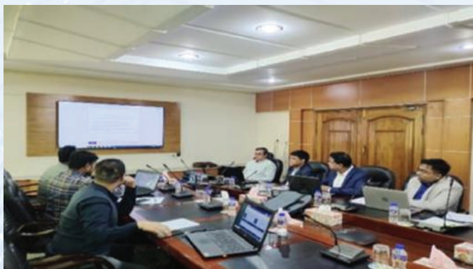
Training arranged by Power and Energy Audit Directorate

Power and Energy Audit Directorate arranged a number of training programs on different audit related issues from January to June 2023 as part of continuous professional development for its officials. Besides, a workshop was held on digital file management system known as D-nothi on April 2023.