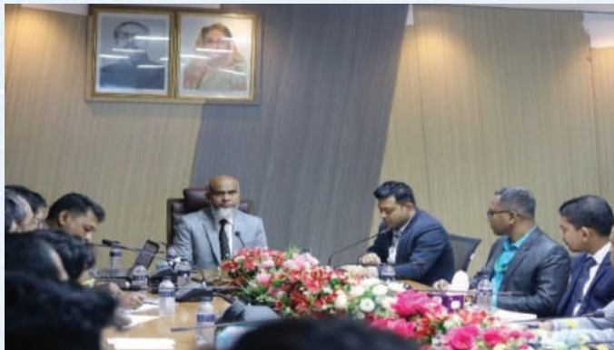
In-house Training on "AMMS-2.0 RP Module and Audit Process in Cash Incentive of Various Sector"