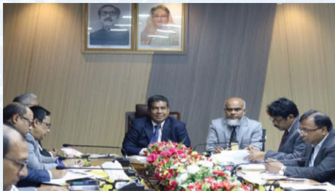
A day-long workshop on Financial Audit