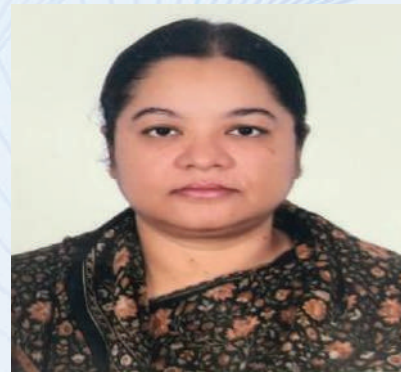
Director General, Agriculture and Environment Audit Directorate