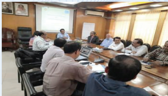
Exit meeting held at FAPAD Conference Room

Exit Meeting: FAPAD organized a couple of Exit meetings held on March 2023 and June 2023. Concerned project directors, financial analysts and representatives from the concerned development partners participated in the exit meetings. It is worth mentioning that 405 audit paras were settled by depositing about BDT 535 crores into the government's treasury and about BDT 33009 crores were settled by providing proper evidence in those exit meetings. Following the exit meeting, 158 project audit reports were issued in that financial year.