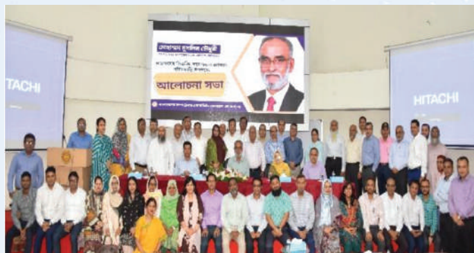
OCAG organizes a farewell ceremony for former CAG on July 11, 2023