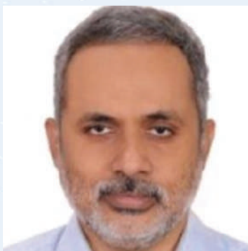
Director General, Works Audit Directorate