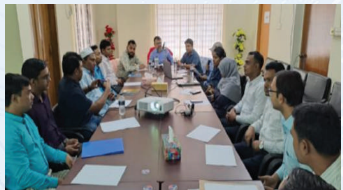
In-house training on e-GP, Data extraction from iBAS++, AMMS 2.0 and D-Nothi & June 24, 2023

In-house training on e-GP, Data extraction from iBAS++, AMMS 2.0, D-Nothi was held at Regional office Sylhet and Regional office Rajshahi, Commercial Audit Directorate respectively on June 24, 2023 and on June 11, 2023.