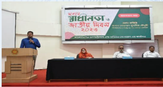
A discussion on Independence and National Day of Bangladesh 2023 arranged by OCAG

The OCAG chalked out various programs on the 53 rd Independence and National Day of Bangladesh. On March 2023 the office arranged a discussion to commemorate the liberation war martyrs. Former CAG chaired the discussion program.