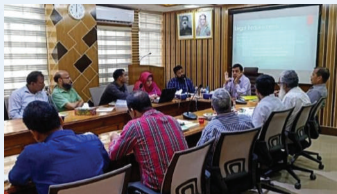
In-house training arranged by Education Audit Directorate

Directorate of Education Audit for the very first time has conducted three financial audits on Bangladesh Open University, Office of the Administrator of Waqfs Bangladesh and Buddhist Religious Welfare Trust.