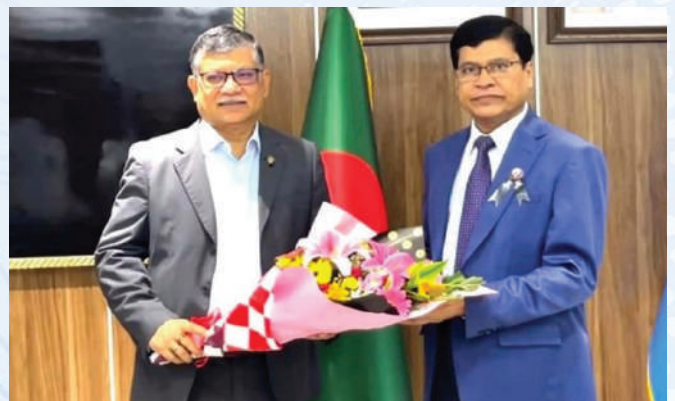
Honourable CAG with Senior Secretary, Ministry of Foreign Affairs

Foreign Secretary paid a courtesy call on the newly appointed Comptroller and Auditor General of Bangladesh. During their discussion the Foreign Secretary highlighted the crucial role played by the Office of the CAG in establishing and maintaining financial discipline in public offices. He expressed hope to work closely with the Office of the CAG in further streamlining financial discipline in the Ministry of Foreign Affairs as well as Bangladesh Missions abroad.