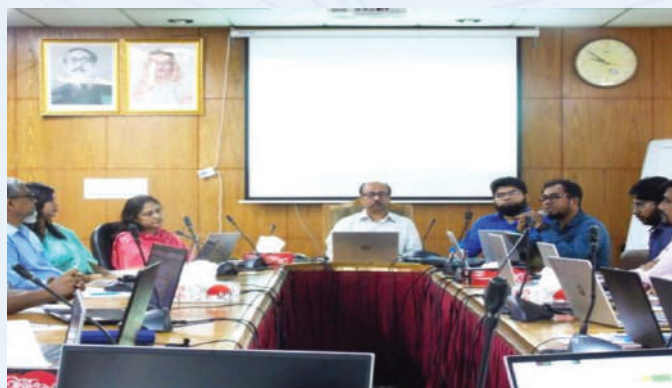
Inauguration of In-house training on D-Nothi

Transport Audit Directorate is one of the largest Audit Directorates under the Office of the Comptroller and Auditor General of Bangladesh. It arranged several trainings, seminars, workshops on e-Audit Module in e-GP system, AMMS 2.0 and D-nothi throughout the year.