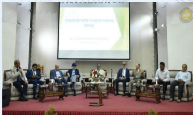
An exclusive commemorative discussion program with the presence of reform luminaries at FIMA