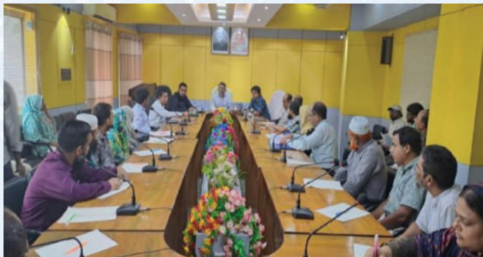
In-house training arranged on June 11, 2023