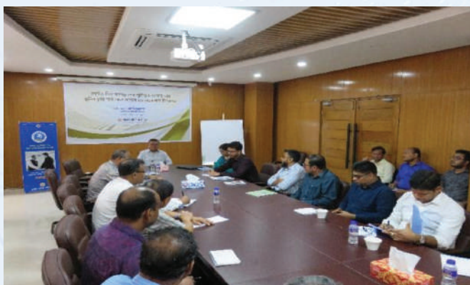
Discussion Meeting on Julio-Curie award on May 23, 2023

Besides, in order to Celebrate the Golden Jubilee of receiving Julio-Curie award the Father of the nation Bangabandhu Sheikh Mujibur Rahman, a discussion meeting was arranged by Revenue Audit Directorate on May 23, 2023.