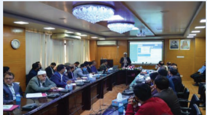
Training on RP Module of AMMS 2.0 at Commercial Audit Directorate on January 8, 2023

Training on AMMS 2.0 RP Module was held on January 8, 2023. 58 participants from 5 ministries and other responsible parties attended the training programme.