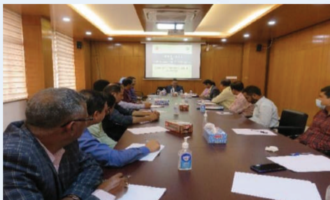
In-house training on Audit Process of Land Development Tax is held at Revenue Audit Directorate

In-house training on Audit Process of Land Development Tax was held at Revenue Audit Directorate on February 23, 2023.