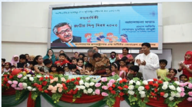
Celebrating 103 rd birth anniversary of Bangabandhu and National Children's Day 2023

In order to celebrate the 103 rd birth anniversary of the Father of the Nation Bangabandhu Sheikh Mujibur Rahman and National Children's Day 2023 a Discussion and Prayer Mahfil was organized at F.K.M.A Baqui Auditorium, OCAG. On the occasion, a drawing competition titled "Bangabandhu and Bangladesh" was also held with the participation of children of OCAG officials on 18 th March 2023 in the premises of Audit Bhaban. The event concluded with prize distribution among the winners of the competition and a prayers ceremony.