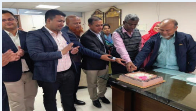
New Year Celebration at office of ADG (Finance), Bangladesh Railway

The New Year was celebrated by office of the Additional Director General (Finance), Bangladesh Railway. Additional Director General (Finance), Joint Director General (Finance) and Director (Finance), Deputy Director and others officers were present on the occasion.