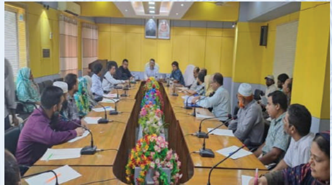
In-house training on “e-GP, Data extraction from iBAS++, AMMS 2.0 and D-Nothi” on June 11, 2023.

An in-house training on “e-GP, Data extraction from iBAS++, AMMS 2.0, D-Nothi” was held at Regional office Rajshahi, Sector-07, Commercial Audit Directorate on June 11, 2023.